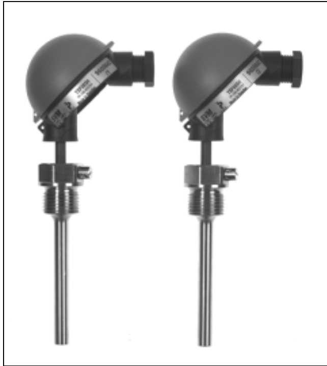
A complete pair

Time seconds Curve A without pocket Curve B with pocket (silicone paste)