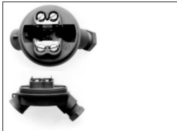
View of the connection head

The sensors are delivered paired to a difference of less than 0.05 °C. The median value of our production and final inspection is 0.02 °C.